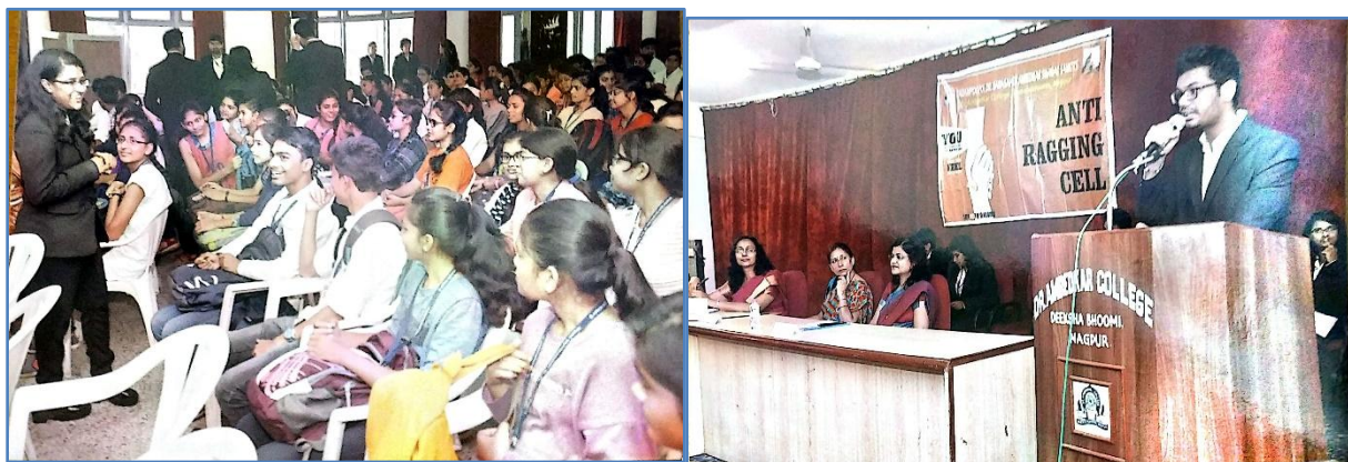
Presentations by Seniors, Interaction with Freshers