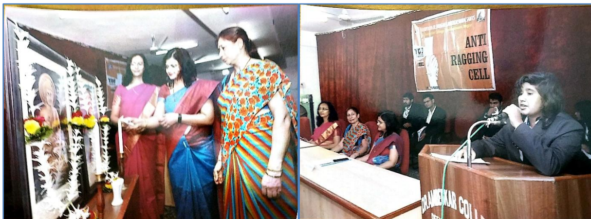
Buddys for Freshers